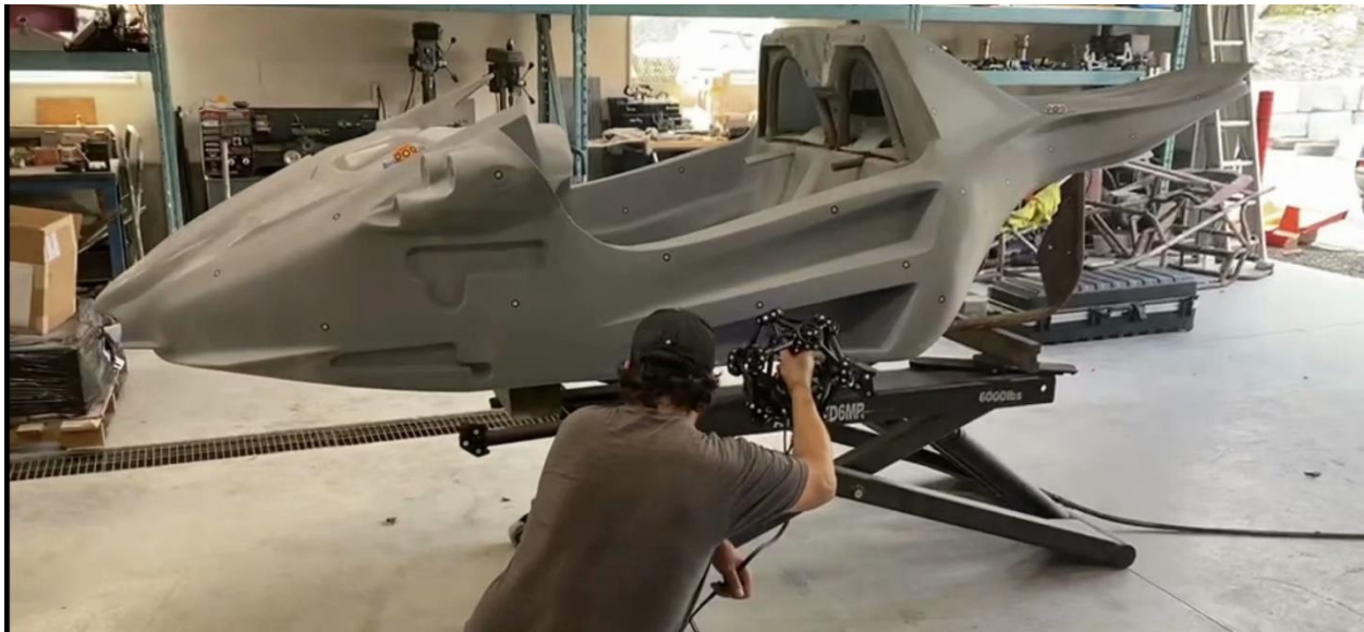
SilverLight’s Second Roadster Model is getting 3-D Scanned ( 07-15-2021 )